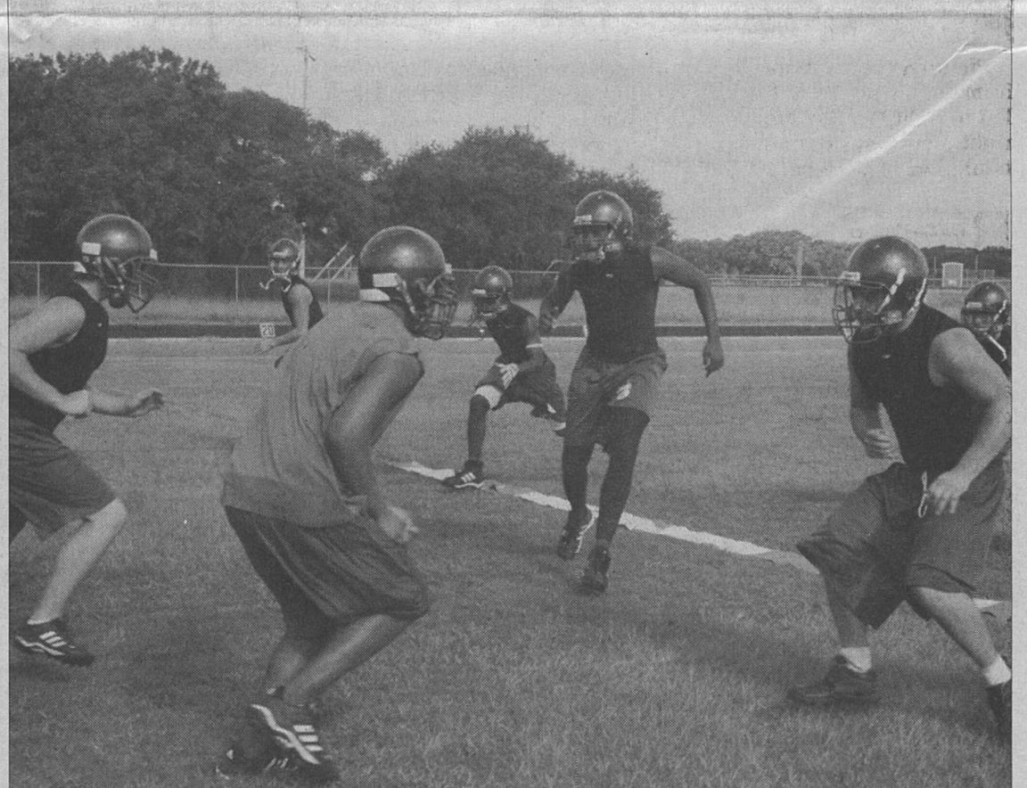
The Raider Football team started workouts on Monday for the coming season.